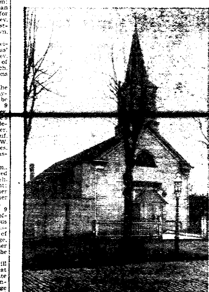
FIRST CHURCH in St. Margaret's parish, Middle Village, was built on a gas-light cobblestone street. Measuring 25 by 50 feet, it accommodated all of the 70 Catholic families in the parish.

On May 18, assisted by several other priests and a few farmers, Bishop Loughlin paid his first visit to Middle Village, to bless the new church building. The new church measured 25 feet wide by 50 feet deep, large enough, by far, to accommodate the 70 families